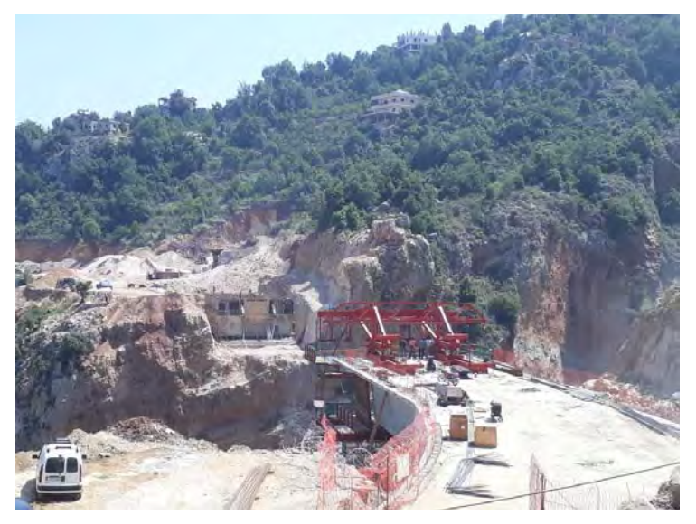
Introduction, Approach, Vision Line of Work, Classification, Management, Portfolio Webpage: parallel-contracting.com